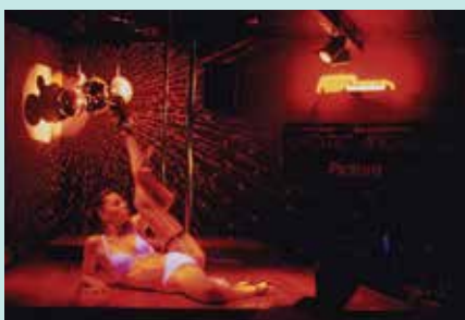
Top: "No bad whores just bad laws" shopping bag (detail), 2014. On loan from SWOP(ACT). Middle: Scarlet Alliance brochure, c.1990. Bottom: Emily, Sinsations , 2006.

Police would visit each brothel every few weeks and keep records of the staff employed. Brothels were effectively limited to Fyshwick, although some operated out of the suburbs. 29 In 1990 Northside Studios was forced to move from the Ainslie shopping centre to Fyshwick after the ACT Government threatened to withdraw the owner's lease, allegedly after complaints from local residents. 30