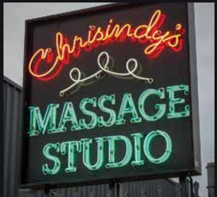
Top: Nikki Stern at the local video shop, pointing to the Let's Make Love video, 1986.